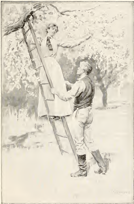
Above their heads the branches twined